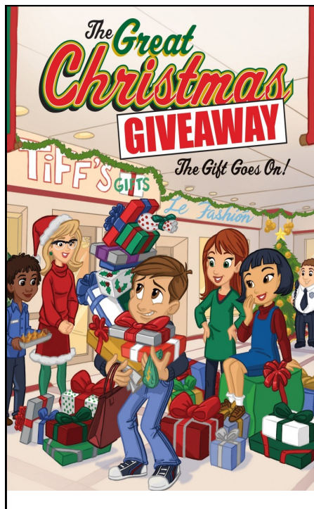
Children's Musical December 10 at 5:30 PM

Romeo Prayer Group 8:00 A.M. every Monday morning at the Galley.