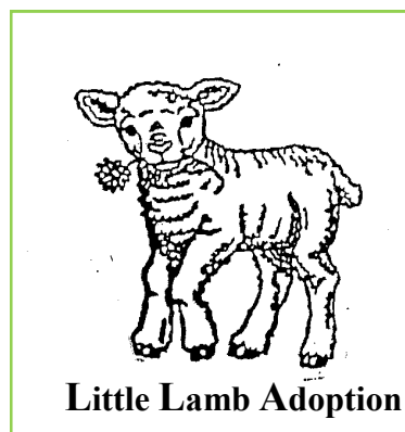
Little Lamb Adoption

Thank you all for adopting us And helping us to be Able to enjoy our time You should come by and see.