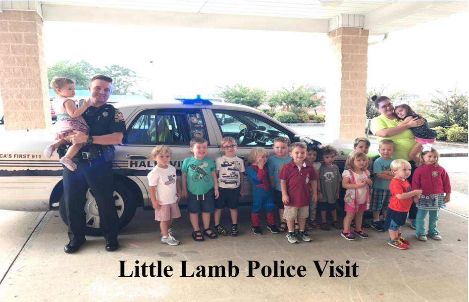
Little Lamb Police Visit