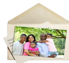
Letter & Photo