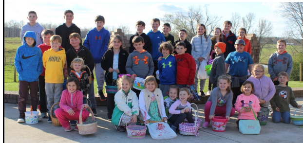
Children's Egg Hunt