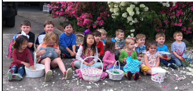
Preschool Egg Hunt