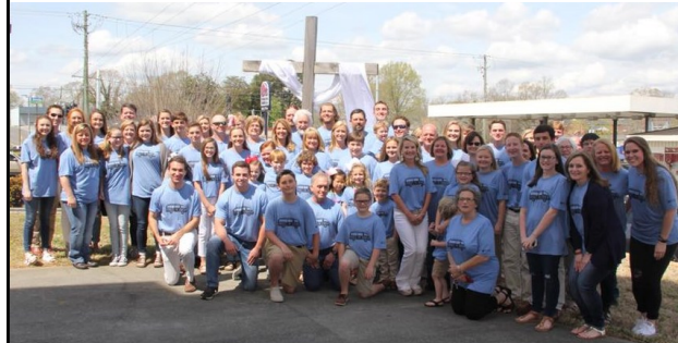
Forget the Frock: 140 Shirts = Over $3000 Raised