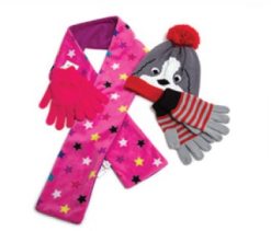
Hats, Gloves & Scarves